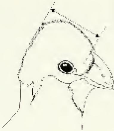
Figure 2. Method of crest measurement in Ruwenzorornis johnstoni .

character seems to be stable within the respective populations; kivuensis has a feathered eye rim, though immatures have the feathers sparsely implanted, shorter and decidedly less glossy than in adults. Among 84 apparent adult specimens, only two (Lac Lungwe, Itombwe—KMMA 58327; Nyawaronga, Virungas—KMMA 100929) seemed to have more sparse feathering around the eye: these localities however are plainly in the kivuensis range, and not particularly close to the johnstoni ( bredoi ) range. All 22 johnstoni and 19 bredoi specimens have a bare eye rim, while the well prepared specimens show a very thin rim of metallic feathers below the bare patch: there does not seem to exist real variation for this character. The difference in occurrence of eye rim types is statistically significant between kivuensis and johnstoni or bredoi (Chi-square; both comparisons p < 0.0001 ). No consistent plumage colour difference between the populations could be found, and none of the plumage characteristics mentioned by Verheyen (1947) hold true for the larger series of bredoi now available. Contra Verheyen, the crest appears marginally (though not significantly) longer in bredoi (mean, in mm, for 4 males: 31.8; 2 females: 30.1) than in johnstoni (mean for 4 males: 30.3; 10 females: 29.7).